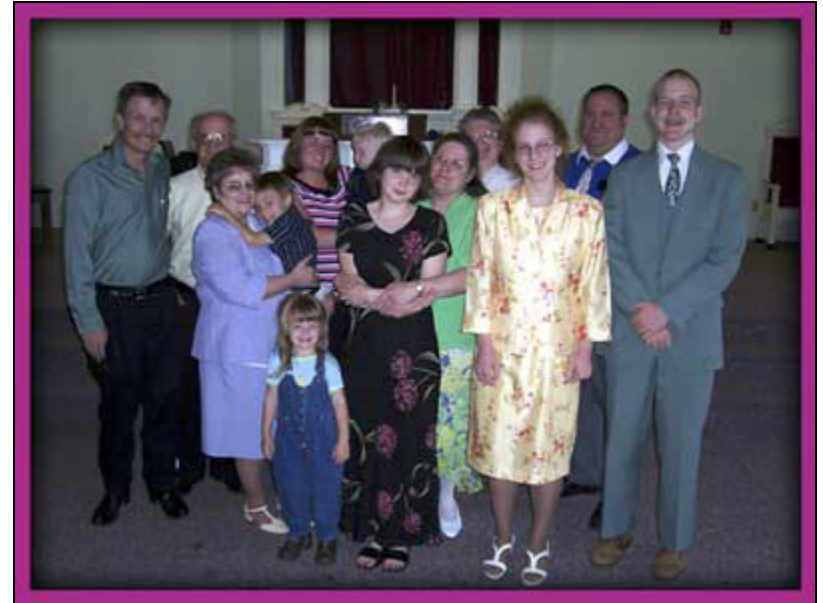
Pray for daughter church, Freedom Apostolic Church of Weston Photo from May 22, 2005 with Prices from CAC (now in Delbarton)