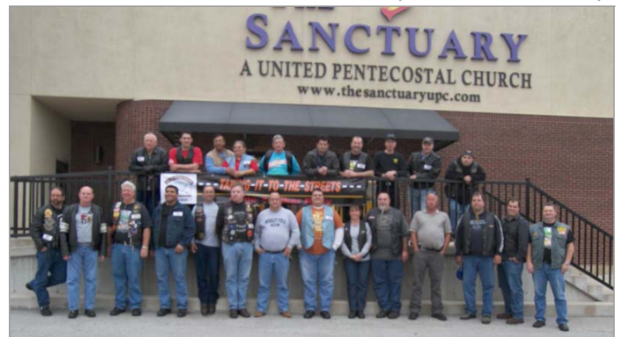
Above: ASRs from across North America gathered for the first ever national ASR meeting. Four ASRs from WV were present, including three from CAC.