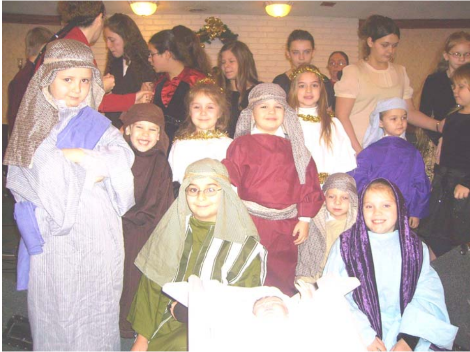
This photo seems like it was taken just yesterday, but it has already been two years since then! Time flies quickly. Let's make the most of the days we get from the Lord. May God bless you in 2010!

Submit your photos for the front of the bulletin to pastor@cac.us.com