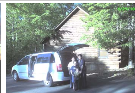
A real log cabin, with two bedrooms, living room, dining room, & full kitchen.