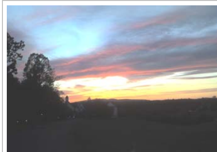
Beautiful sunset on our first night in Virginia's Shenandoah Valley region.