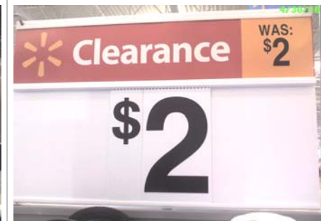
Shopping! Elliana loved the humor in this. It used to be $2. Now it's on sale for... $2!