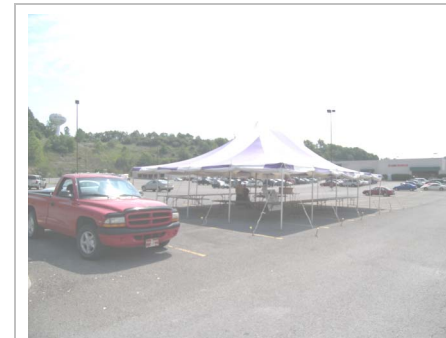
CAC fireworks tent at the mall.

Official Site: cac.us.com • CAC Live: caclive.ning.com • Church: (304) 624-4459 Pastor: pastor@cac.us.com • Home: (304) 624-1388 • Cell: (304) 629-1196