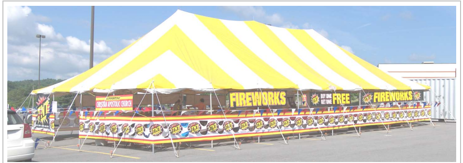
One of our two tents. (This one is at Meadowbrook Mall. The other one is at Sam's Club.)

It's fireworks time as we celebrate Independence Day! Many thanks to all who have helped and will help!