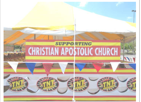
Nice new banners show the church's name at both of our tent locations.