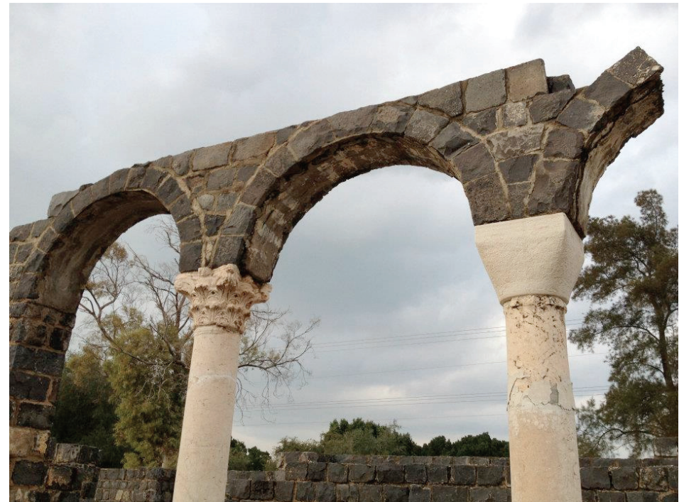
Above: At Kursi National Park, Israel. Ruins of a Byzantine (4th C.) Christian church located at foot of the steep place where Jesus freed a demoniac, and the demons went into swine. Ruins of Jerash, one of the cities of the Roman Decapolis ('ten cities') are at the top of the nearby hill.

Today is our Fifth Sunday Celebration at CAC! There is only one service at 10 am. (No evening service.) Also, please note that because of this, there is no Timothy Group meeting today. However, the Timothy Group meetings will resume at 4:30 pm each Sunday, going forward. Let's enter His presence this morning expecting great things!