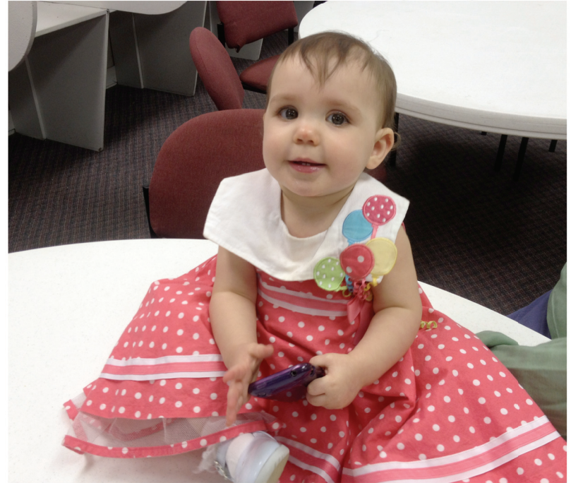
Submit your pics to pastor@cac.us.com