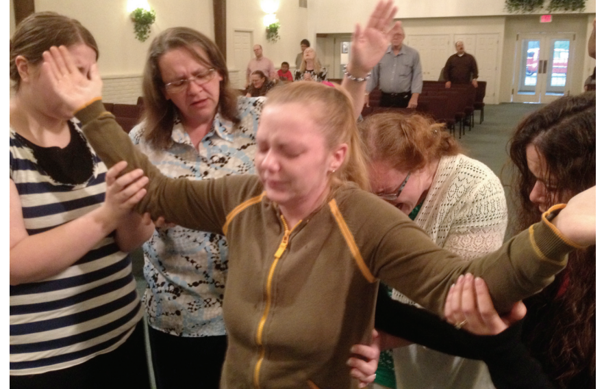
Submit your pics to pastor@cac.us.com