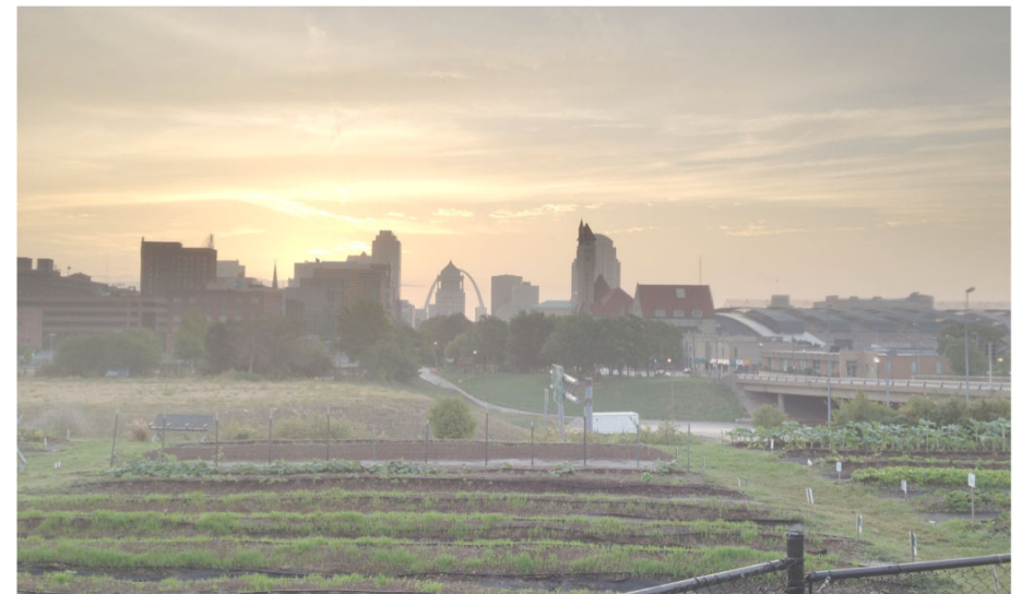
This is the downtown "skyline" of the City of St. Louis at dawn, with the famous St. Louis Arch in the distance (center-left, behind a building). The sky was so bright it silhouetted the ground. The photo had to be taken twice, at two different exposure settings, and then both exposures were combined in Photoshop to render a single photo. The human eye is so much more adaptive than the best cameras ever made. We are fearfully and wonderfully made!