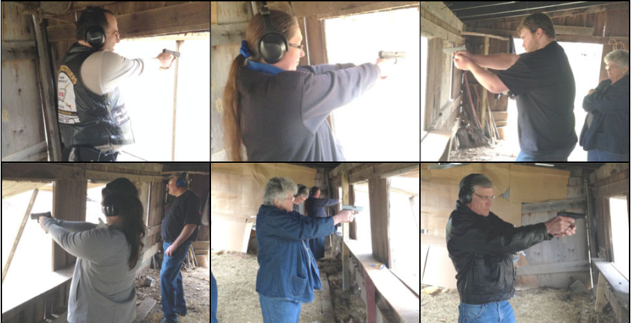
The Concealed Carry Class was a successful event. The students learned basic pistol safety in a course that qualifies them to apply for a Concealed Carry Weapons Permit. Passing the course requires a written exam and shooting to qualify. The shooting proficiency required is to have 8 out of 10 shots hit within the target zone. Everyone who signed up passed the test and qualified on the shooting range.