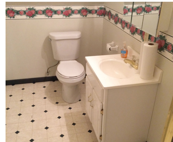
Kieran installed new toilet upstairs. Bathroom cleaned (other than shower) and ready for use.