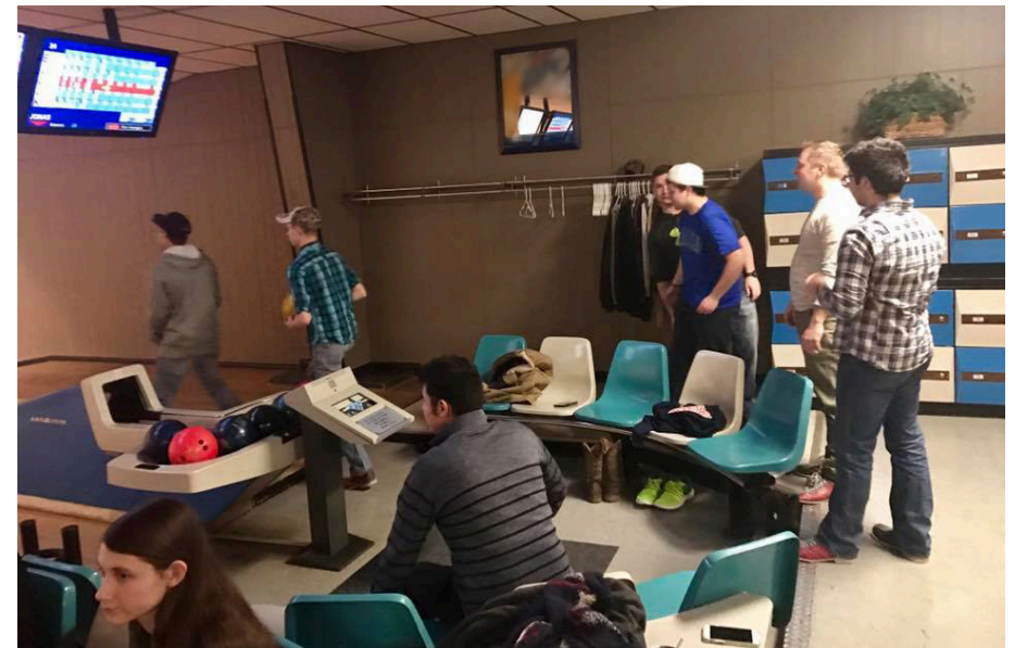
Yesterday evening (March 11, 2017) there was a great turnout for the CAC FISH Student Ministry bowling night. Everyone had a fun time.