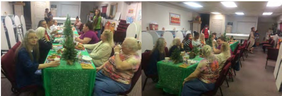
Pics from yesterday's Ladies Ornament Exchange Party